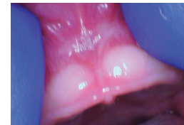
7 Days Post-Op