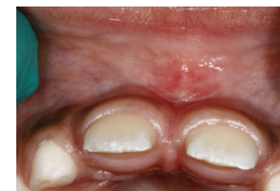
2 Days Post-Op