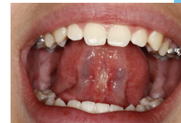
7 Days Post-Op