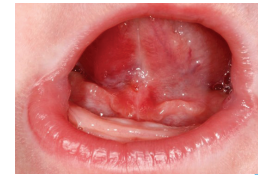
10 Days Post-Op